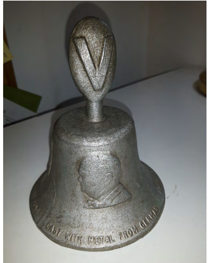
University Club; the Winspear Room