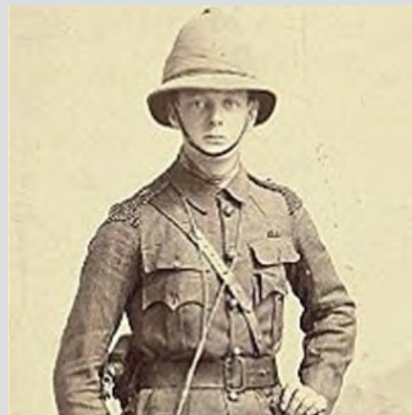
23 year-old Winston

1897 On July 26, while on leave from his regiment, Winston made his first political speech to members of the Primrose League at Claverton Down near Bath.