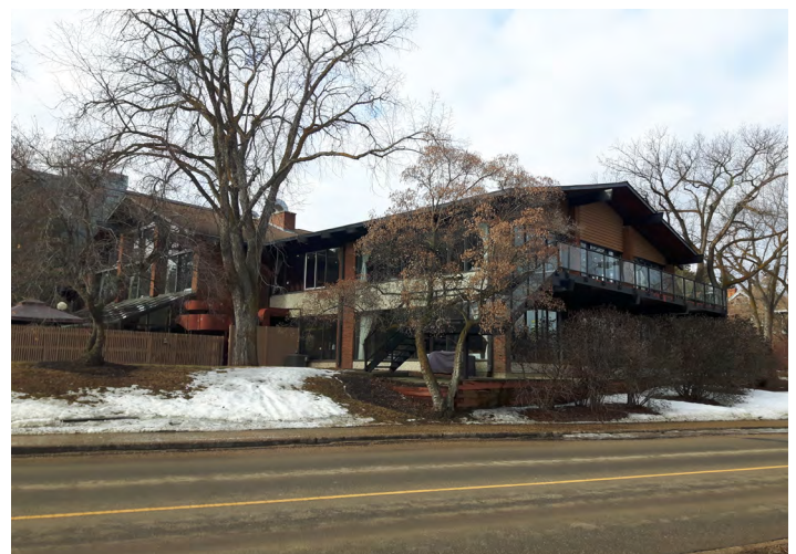
University Club from Saskatchewan Drive