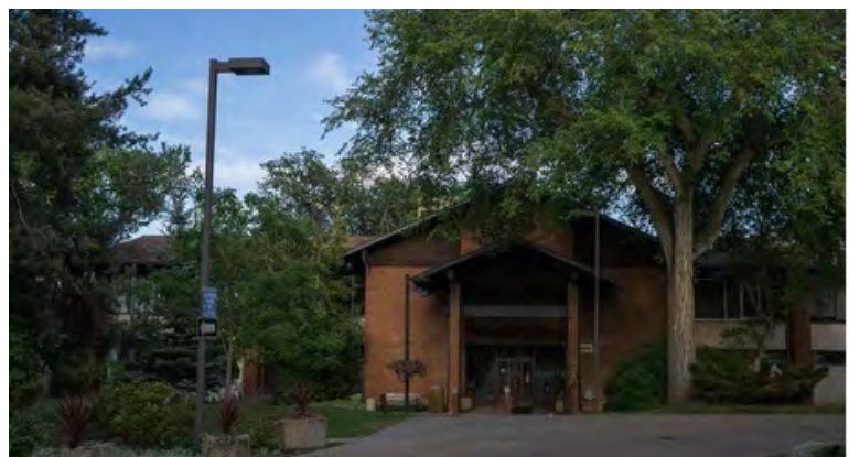
The University Club