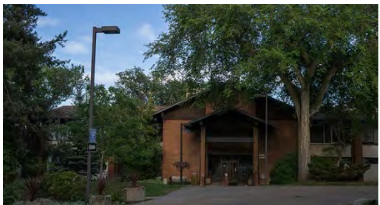
The University Club