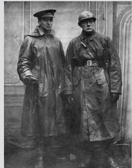
Churchill, wearing a French 'Adrian' helmet, with Archibald Sinclair at Armentieres in February 1916.