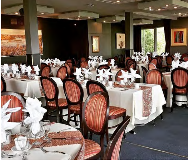
University Club; the Winspear Room

Our 2020 Memorial Banquet will be the 56th since the first one in 1965. Lord Harding of Petherington gave the keynote address on that occasion. Since then we have hosted a succession of Churchill's contemporaries and colleagues, statesmen, and soldiers at our banquets. In more recent years, as those who knew or worked with Churchill became scarce, we have usually invited historians, historiographers and biographers, including Sir Martin Gilbert, John Keegan and Baron Black of Crossharbour.