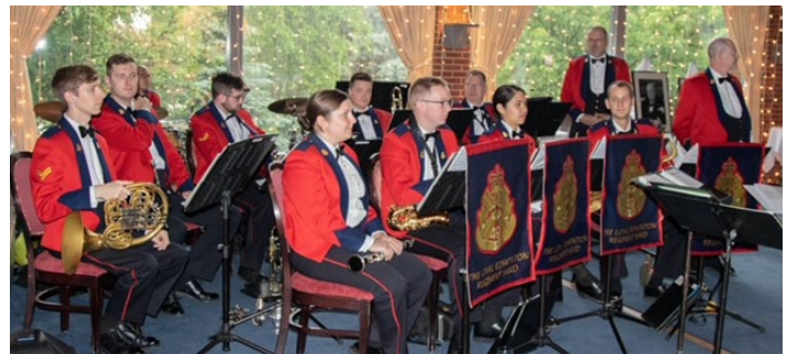
The Loyal Edmonton Regiment's Dinner Ensemble provided both military and popular music for the dinner's duration. To close the evening, several band members quickly changed into another uniform reminiscent to the late 1880s/early 1900s to perform their popular black-light Drumline show. It harkens back to an era where drums and bugles would issue signals on battlefields. The Regimental Piper escorting the Head Table wore a First World War uniform and accoutrements.

During this year's summer solstice, in keeping with our decades old banquet traditions and aims, our one hundred and fifty participants enjoyed a magnificent dinner in Churchillian fashion in the company of our Honourary Patron and accomplished keynote speaker. A noticeable military flavour included a military chaplain leading us through Grace, members of several regiments in attendance, and honorary colonels and military headquarters personnel. The Loyal Edmonton Regiment's Dinner Ensemble, Piper and Drumline were deeply appreciated.