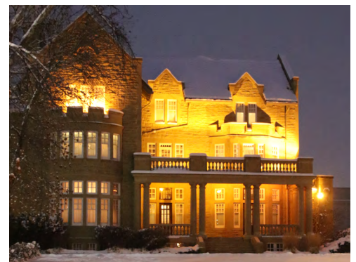
Government House, Edmonton