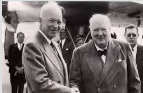
Winston and Ike

1953 Churchill meets with President-elect Dwight Eisenhower January 7 ahead of Eisenhower's inauguration. He is unable to convince Eisenhower to meet with Stalin.